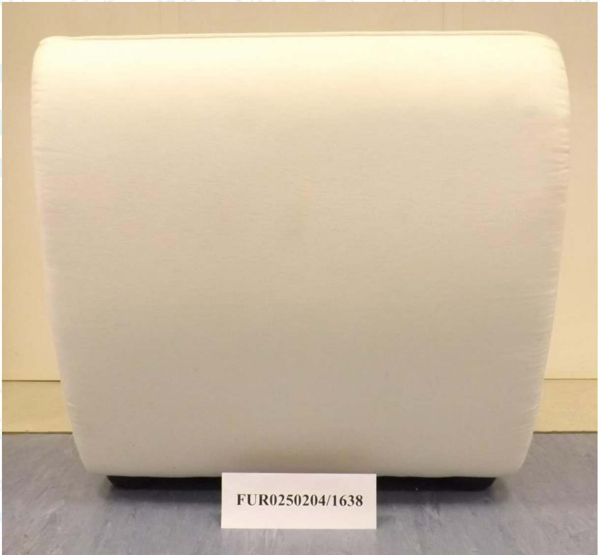
Rear view of the 'SNUG Chair'