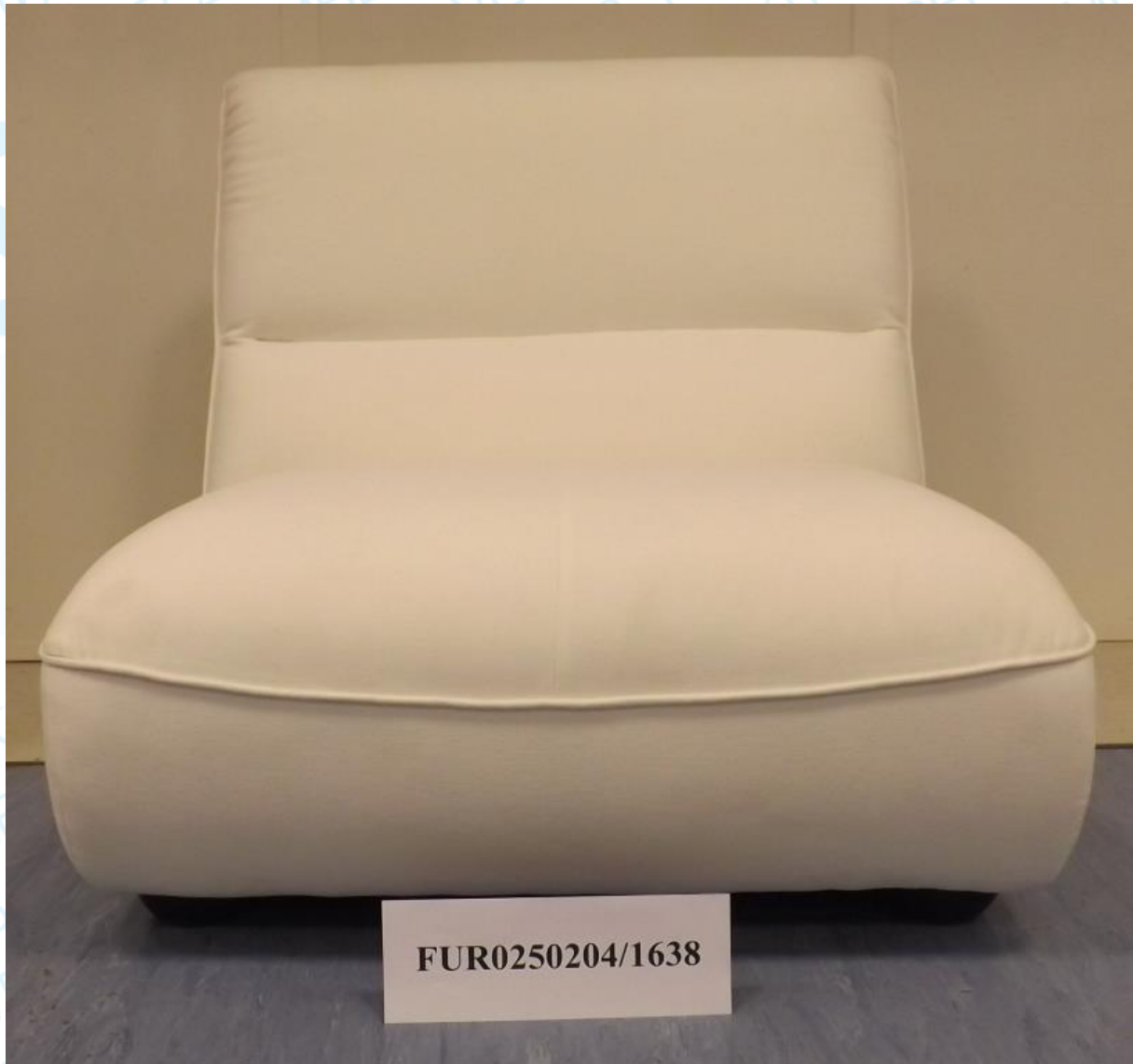
Front view of the 'SNUG Chair'