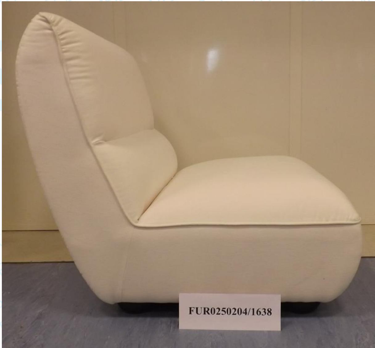
Side view of the 'SNUG Chair'