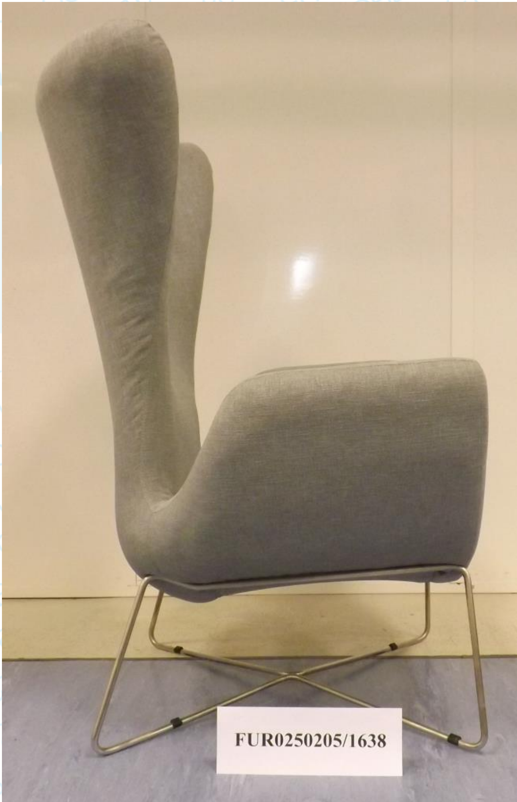
Side view of the 'SMILE Chair'