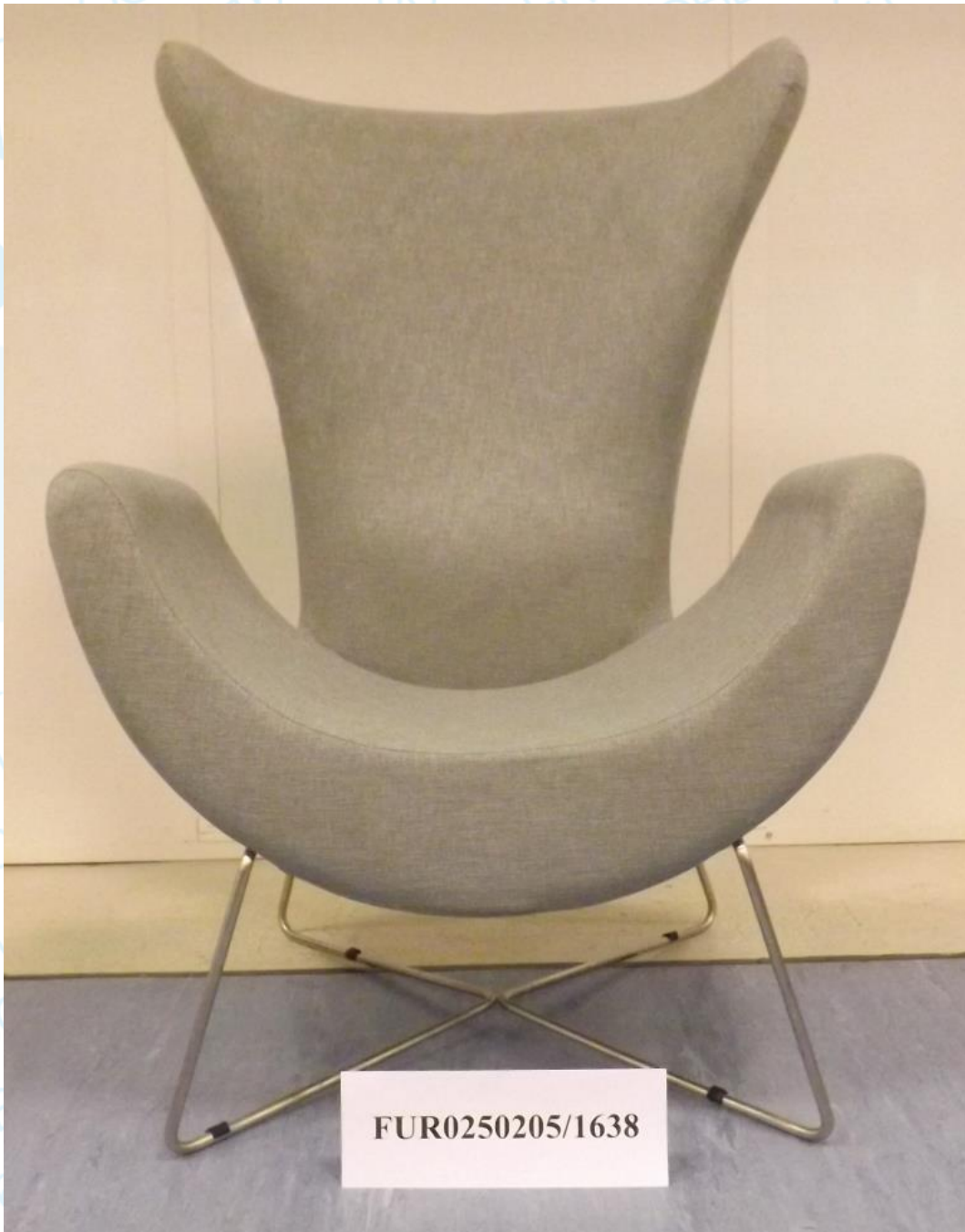
Front view of the 'SMILE Chair'