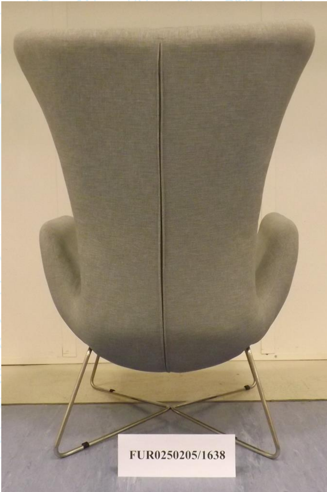
Rear view of the 'SMILE Chair'