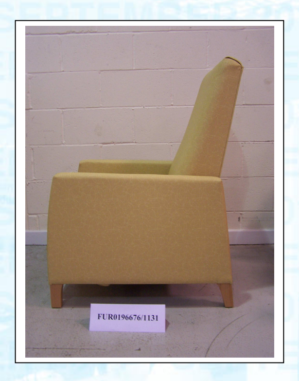
Side view - Recondo/Maloy Recliner Chair