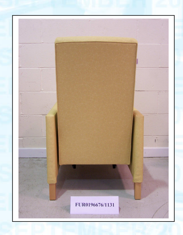
Back view - Recondo/Maloy Recliner Chair