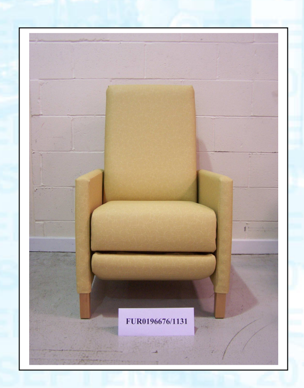
Front view - Recondo/Maloy Recliner Chair