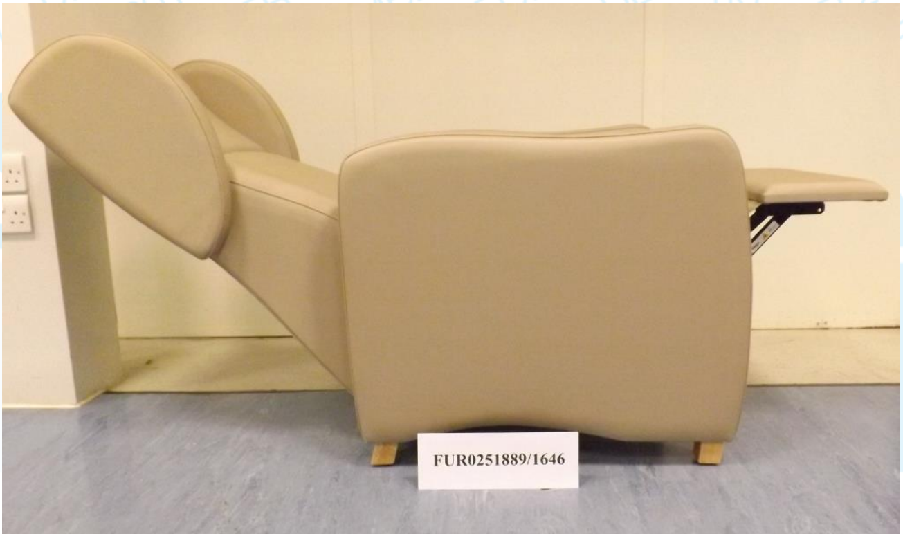
Picture 4: Fully reclined side view of the 'Vida Fully Upholstered Recliner'